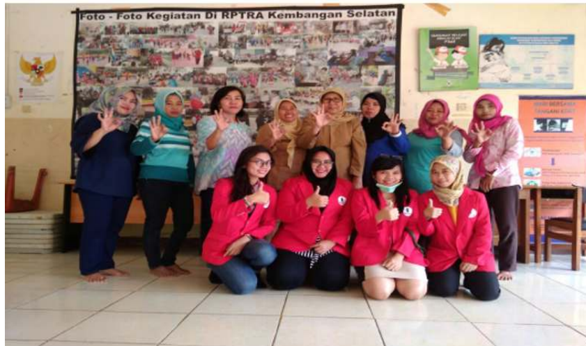
Figure 8. Survey to the location of RPTRA Kembangan Selatan

On August 8, 2018 the Real Work Lecture Activity was filled with Training held by Students and Lecturers from Mercu Buana University. The training was filled with 4 training sessions namely: Training on healthy, independent and prosperous families, Training on family financial management., Training on family food security, Training on how to plant and maintain fish with an aquaponic system.