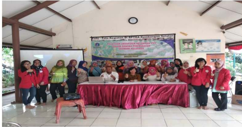
Figure 9. Training Activities on 8 August 2018