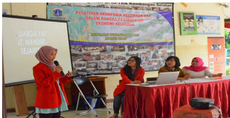
Figure 11. Presentation of Healthy, Independent and Prosperous Families brought by Mercu Buana Students

It should be noted that before reaching a prosperous condition, families often get threats, challenges, obstacles and disturbances that can always destabilize the family's existence. Various forms of threats, challenges, obstacles and disturbances can come from outside and within the family itself. All of that if it cannot be overcome immediately, will be a serious barrier in an effort to improve the quality of the family. In such conditions, it is certainly less likely to be able to create the expected individuals. Therefore, in order to overcome all these problems, the family must mobilize all its power and effort and utilize all its potential to be able to meet all the needs of its members. In addition, the family must also endeavor to always create a safe, peaceful and comfortable atmosphere at home which is a guarantee for all family members to be able to "stay at home". Building a prosperous family, thus, in essence not only means eradicating the family from poverty alone and physical needs, but also various other dimensions of needs that include psychological social and self-development for a longer period of time. One of the things that underlie it is that the need for a prosperous life is not enough only from the fulfillment of external needs, but also from the inside.