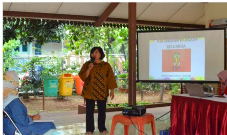
Figure 13. Presentation of Family Food Security was delivered by Mercu Buana Lecturer

Law No.7 of 1996 concerning Food, defines food security as: conditions for the fulfillment of food for each household, which is reflected in the availability of sufficient food, both quantity and quality, safe, equitable, and affordable. Understanding of food security includes macro aspects, namely the availability of adequate food; and at the same time micro aspects, namely the fulfillment of the food needs of each household to live a healthy and active life. At the national level, food security is defined as the ability of a nation to guarantee that all its inhabitants obtain adequate food, adequate quality, safe; and is based on optimizing utilization and based on the diversity of local resources.