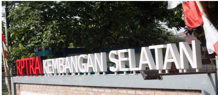
Figure 1. RPTRA Garden Kembangan Selatan

Community Service Activities have been carried out in the Child Friendly Integrated Public Space (RPTRA) of Kembangan Selatan village, Kembangan District, West Jakarta. Distance from Mercu Buana University to the Location is around 4.8 Km. Access to reach the location can be reached by using a two-wheeled or four-wheeled vehicle. The South Kembangan Village was chosen as the place of activity with consideration that the location of the Integrated Child Friendly Public Space Hall (RPTRA) could be used for productive activities for the PKK group. RPTRA Kembangan Selatan was built on an area of 2,304 square meters located on Kembangan Abadi 2 RT. 01/08 Kelurahan Kembangan Selatan, West Jakarta. RPTRA is equipped with various facilities among its multipurpose rooms, libraries, toilets, futsal courts, children's playgrounds, nutrition pools, planting spots, lactation rooms, PKK MART, as well as family medicinal plants.