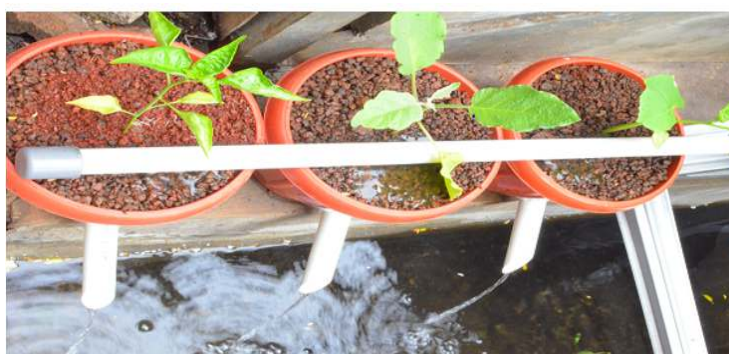
Figure 15. Plants in pots that use special stones flowing by water pipes.

The basic principle in an aquaponics cropping system is a system of recirculation or reuse of water flow that was previously used in the maintenance of fish and plants cultivated at the top act as filters or water filters. The plant will use waste material produced by fish as nutrients or nutrients needed so that the use of nutrients in this medium is very minimal and the plant does not need chemical fertilizer anymore.