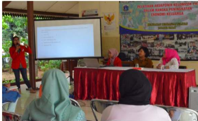
Figure 12. Family Finance Management Presentation was delivered by Mercu Buana University Students

Do you have a family and often have difficulties in planning and managing family finances? If you answer yes, the problem must be immediately found a solution because if it is left unchecked, it is likely that you will experience financial problems that lead to your trapping in debt. Be aware that this problem will make you and your family unable to live life calmly because it is always haunted by bills or debt installments every month. Do you want to continue to live like that? For that, plan your family finances as well as possible from now on so that your life does not continue to be trapped in financial problems. How to regulate mandatory finance to achieve family financial goals : zakat, Infaq and alms 5%, 10% emergency fund, cost of living 50%, 10% short-term savings, 5% investment How to realize good financial management so that families become prosperous; do not be lazy to make monthly and non-routine budgets, distribution of the financial post budget into envelopes, discipline against plans that have been made, conduct evaluation.