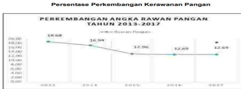
Figure 14. Graph of Prone Figures