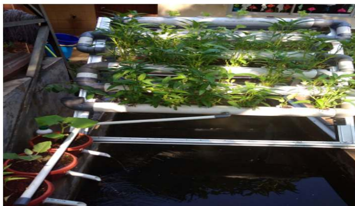
Figure 14. Aquaponic equipment installed at RPTRA Kembangan Selatan

The basic principle in an aquaponics cropping system is a system of recirculation or reuse of water flow that was previously used in the maintenance of fish and plants cultivated at the top act as filters or water filters. The plant will use waste material produced by fish as nutrients or nutrients needed so that the use of nutrients in this medium is very minimal and the plant does not need chemical fertilizer anymore.