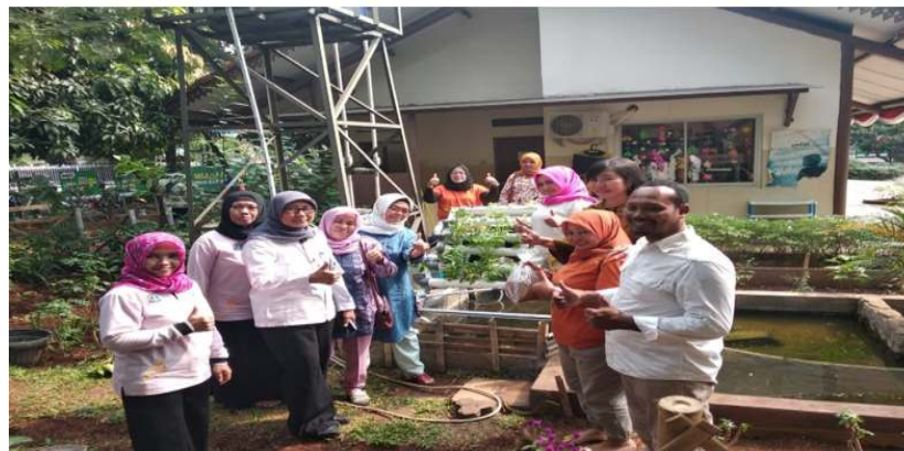
Figure 10. Aquaponics Training August 8, 2018

The following below is the Training Material presented during the implementation of the Real Work Lecture activity: Presentation Material on Healthy, Independent and Prosperous Families "What is Family? And how important is the family in your eyes ?? ". Family is two or more than two individuals who are joined because of blood relations, marital relationships or appointments and they live in a household, interact with each other. The reciprocal relationship between husband and wife is because they are the main actors. In addition to husband and wife, the family component that is no less important is the presence of children, a family has at least the following characteristics: consists of people who have blood ties or adoption. members of a family usually live together in one house and they form one household, having one unit of people who interact and communicate with each other, who play the role of husband and wife, father and mother, child and brother, maintaining a shared culture that mostly comes from a broader general culture.