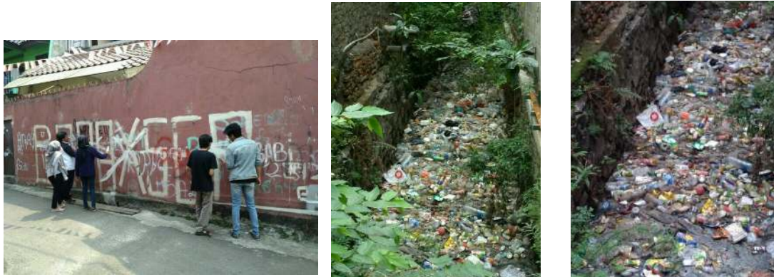
Figure 1. The resident areas in Sudimaras before the programs