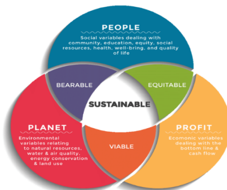
Figure 1. Triple Bottom Line