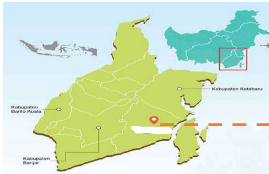
Figure 2. Region with various stakeholders

John Elkington identified the concept of the "Triple Bottom Line" (People, Planet, Profit) as a sustainability concept that addresses the balance or harmony between economic sustainability, social sustainability, and environmental sustainability within the life of a country or region with various stakeholders such as the government, society, businesspeople, and others (Freeman, 1984). The project area is located in Banjarmasin Regency, South Kalimantan, with the site described as follows: