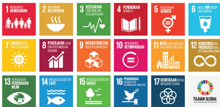
Figure 3. Sustainable Development Goals

All of these concepts share a similarity in their implementation with the 'land ethic' concept, which emphasizes that humans must treat land, water, plants, and animals as part of a broader moral community (Leopold, 1989).