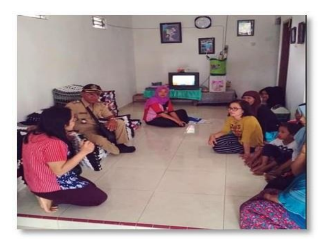
Figure 3. Evaluation management business doormats

Evaluation is stages important in learning management business based on entrepreneurship. Evaluation see and measure influence innovation for success business craft doormat. The PKM program's accompanying lecturer visited group craftsman with bring the old BMC as well compare with BMC which already operate innovation.