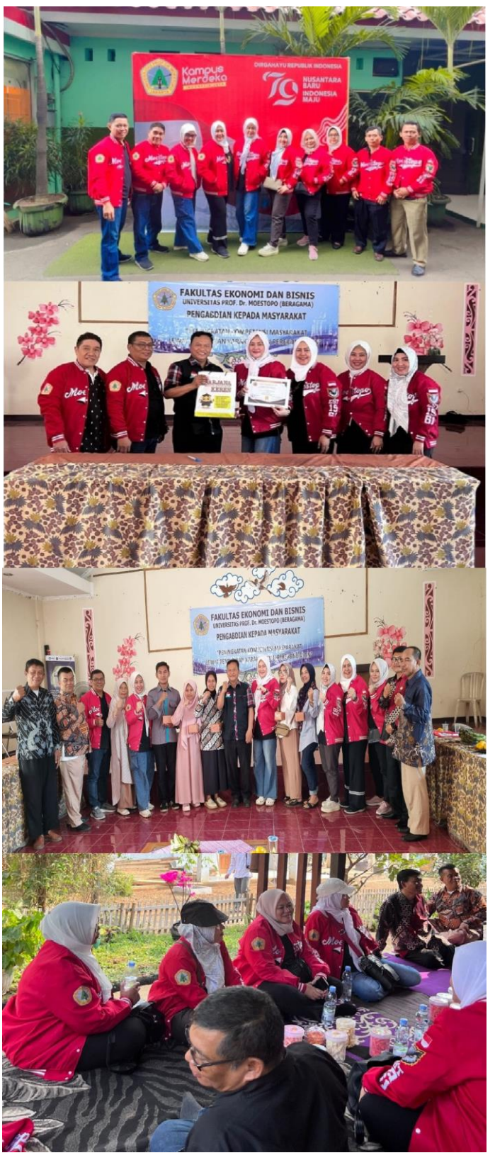
Figure 5. Documentation