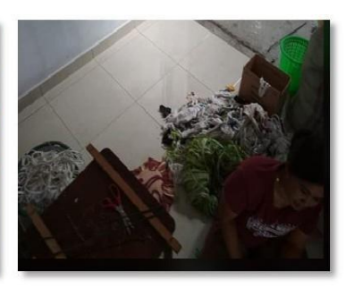
Figure 4. Documentation from tool print used craftsman.

Besides tools print material most important For produce a doormat is cloth patchwork (Figure 7). Patchwork which is cloth waste from factory purchased textiles craftsmen and packed by partners in big sack. Craftsman will choose cloth patch based on same color so that during the weaving process more short For produce doormat with same color. Patchwork consists of many kinds of color and size so that craftsman need sorting moreover formerly (Prihanto et al., 2023).