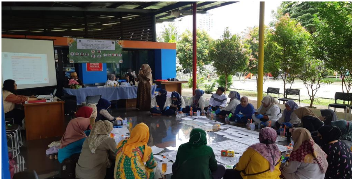
Activities Documentation, 2023