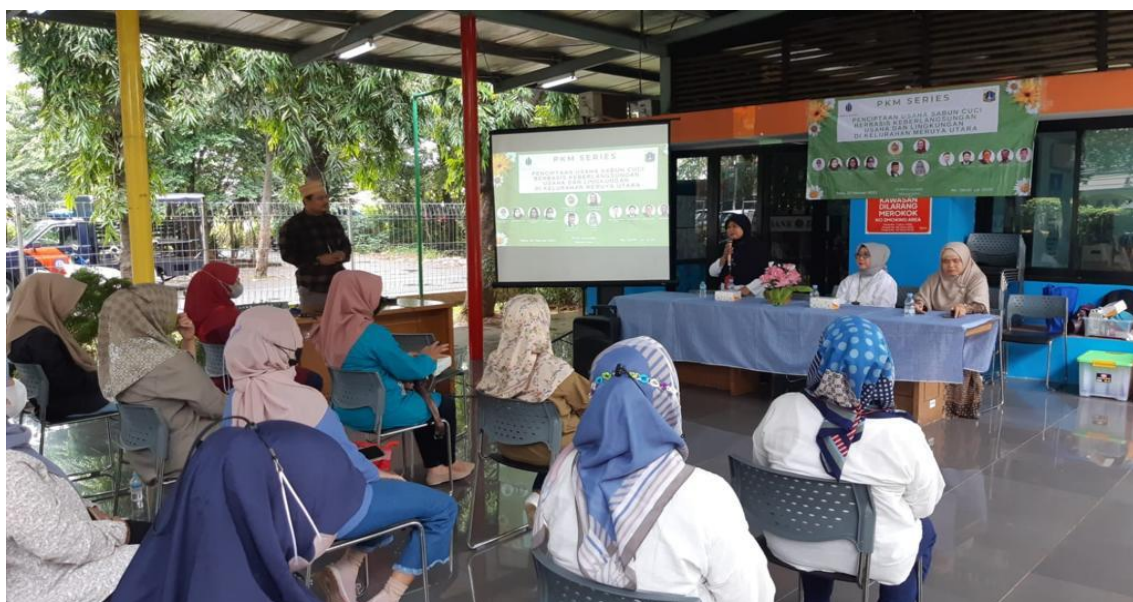
Activities Documentation, 2023