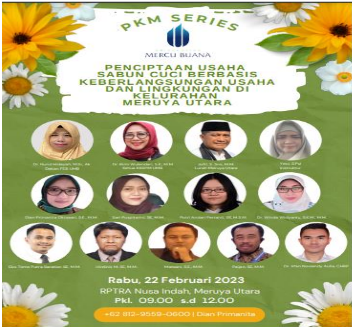
Activities Documentation, 2023