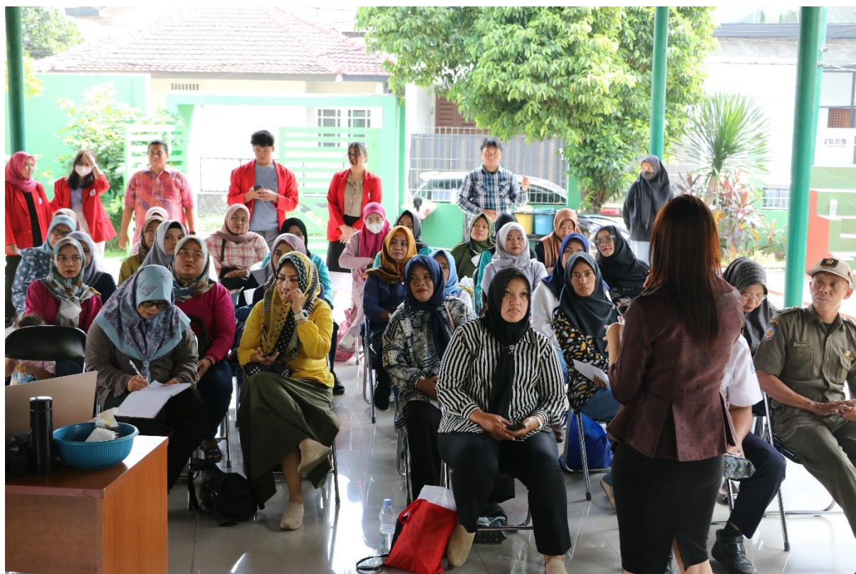
Activities Documentation, 2023