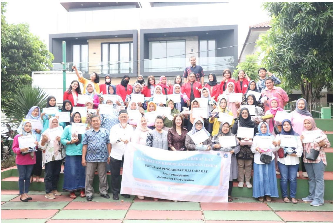
Activities Documentation, 2023

After participating in this service activity, participants are expected to understand and be able to prepare financial statements using online applications that are practiced directly in front of residents. During the practice, residents are introduced to theory and how to practice so that it is easy to apply to the community. Activity Evaluation Mechanism Evaluation of activities is carried out after two months of implementation of activities up to the fourth month to monitor the extent of success. Instructor evaluation questionnaire related to the presentation of material. Evaluation questionnaire for the implementation of activities related to socialization activities.