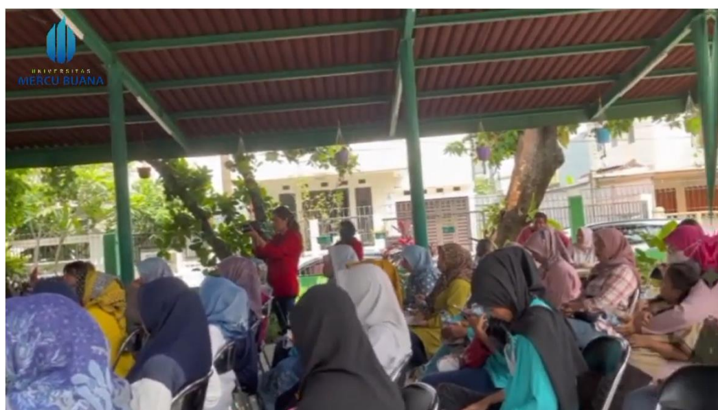
Activities Documentation, 2023