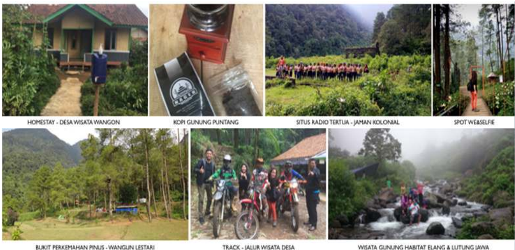
BUKIT PERKEMAHAN PINUS - WANGUN LESTARI

The Tourist Village - Pasirmulya, Banjaran District, Bandung Regency, West Java, is geographically located on the slopes of Puntang Mountain, an area that has a lot of potential as a thematic tourist destination, including the best coffee plantations and products in the world, tourist sites Radio transmitter relics in the Dutch colonial era, cross-country cycling tracks, natural tourism and beautiful panoramas, cultural and life art of the agrarian Sundanese indigenous peoples are relatively well maintained, handicraft centers and special food, and one of iconic destination is a Tourism Village Homestay – Wangun. All of which are very potential destinations alternative tourism, because it is very close to the city of Bandung.