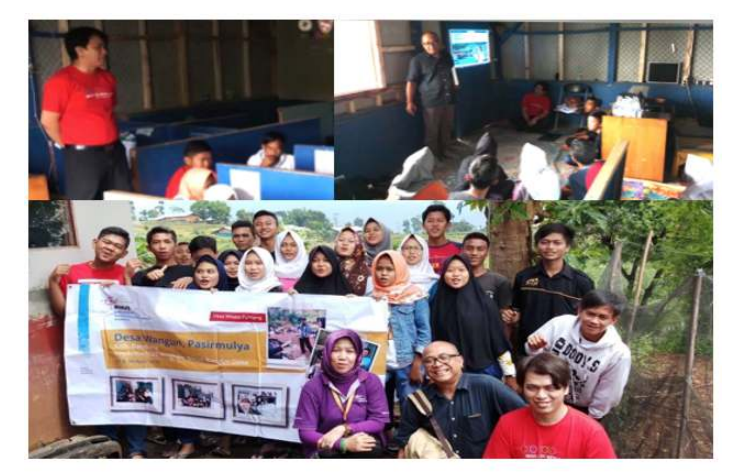
Figure 4. Training Web Content; Young Resources - Pasirmulya, Source: writer

They get training in photographing, processing the results of shots and discussing ideas that are relevant to the needs of web content. This training process is directly carried out during a visit to Pasirmulya or remote villages through remote assignments and the results are discussions through the internet, this is to familiarize them to experience communication with internet use. All of this is just basic training as an experience to be improved as an experienced content maker, web admin who can answer all the interactions that come in and update content regularly, programmers behind the next web development with certain sub-themes, and the final objective is the website will auto maintain by local recources. It will expected that in the long run, this training can be continued more intensively and involves community development programs carried out by students with supervision and guidance from lecturers, so that they can learn from each other and fuse the gap as village and city boys.