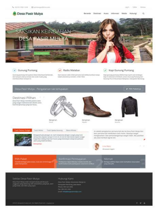
Figure 3. Web Prototype; Tourist Village - Pasirmulya

Web like home building, content is the activities that live in the building. We focus on training young people, to be able to create interesting story content both in photos, videos, or news that supports tourism. This training is to foster an understanding of what issues are interesting for outsiders to stop and travel in their village.