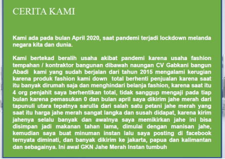
Figure 6. Creative Mindset about story of GKN Jahe Merah

The participants shown creative mindset when presenting their products and stories. They acknowledge that creative is important in creating new products or marketing campaigns. However, terminology "creative" also needed when dealing with employee and stakeholders.