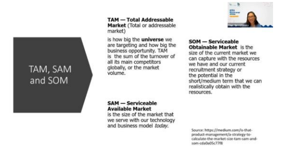
Figure 5. Example of Online Meeting in Bootcamp

The asynchronous activity is analyzed using the assignment score. There are 4 assignments consist of manpower planning, production planning, business model canvas and income statement. The score is based on completeness (35%), quality of assignment (40%), and reflection paper (25%). The feedback is given via online and the revision is crosschecked at final submission.