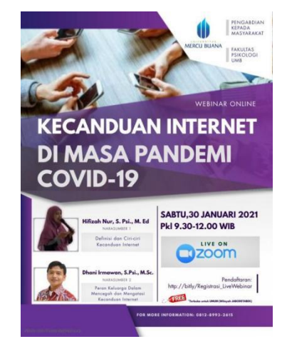
Figure 1. Activity Brochure Announcement

The distribution of flyers to promote psychoeducation was carried out on January 18, 2021 through Facebook and WA groups, as well as by opening registration until January 29, 2021. About 64 participants registered for this event and there were several people who lived outside JABODETABEK.