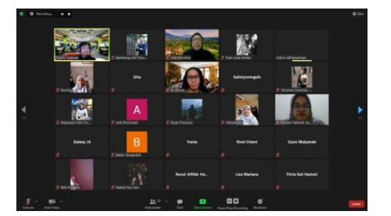
Figure 2. Activity Implementation

After that, we continued with the presentation of session 2 from 10.15 WIB to 11.00 WIB. This session was conducted interactively, where the speaker invited participants to discuss the role of the family in preventing and overcoming internet addiction. After the two sessions were over, a brief rest was held, then followed by a question and answer session directly to the two presenters until 11.45 WIB.