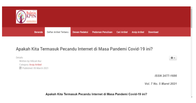
Figure 5. Published Article