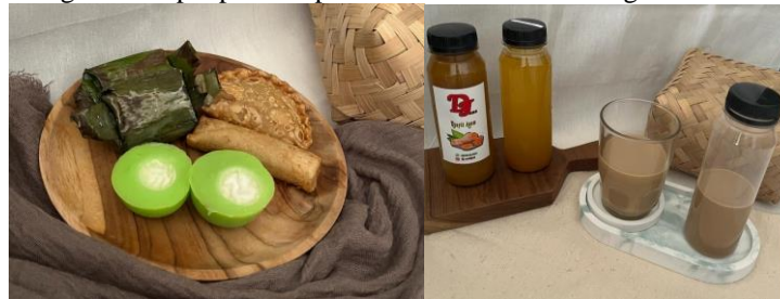
Figure 3. Example of Result Photo Technique Training

During the training to make product photo techniques, participants were given ways to make the product photos attractive, besides that angels in taking product photos became one of the successes to get good and attractive product photos. The following is a sample product photo at the time of training.