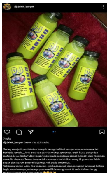
Figure 2. Product Promotion on Instagram

After creating an Instagram account that is used to promote, trainees are given the task of posting photos of their products to the Instagram account and providing captions related to the products being sold. Here is one of the posts from participants about the products sold and the captions made.