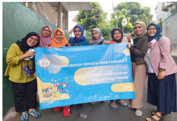
Figure 5. Photo of Community Service Activities

In this activity, training was also carried out in making photos of attractive food products and editing social media promotional content.