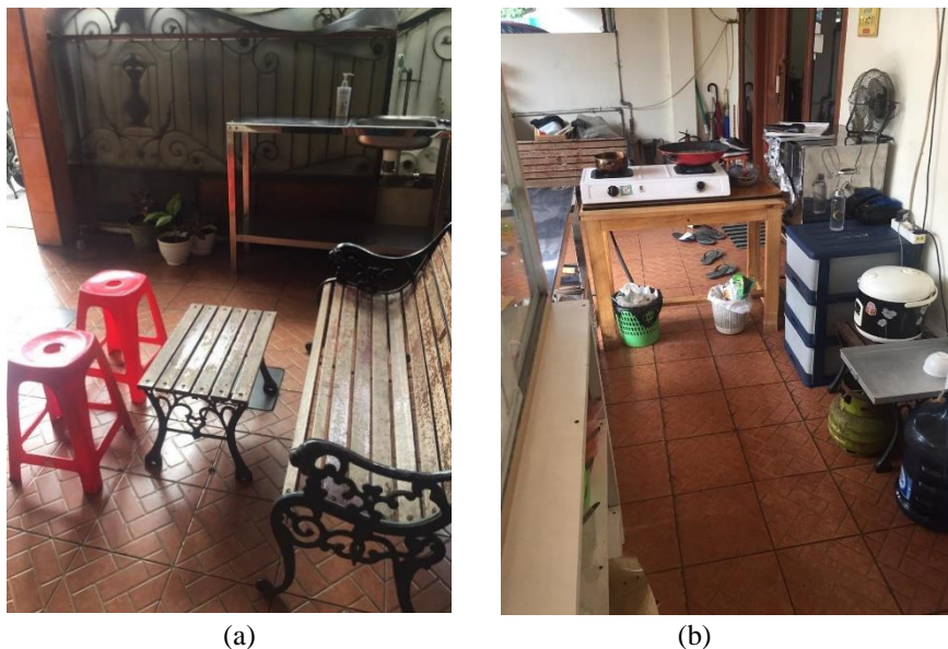
Figure 1. Dining area (a) and production area (b)

In 2016, MSMEs in Bekasi City had reached approximately 203 thousand based on the National Economic Census. MSMEs provide accommodation and food drinking as many as 47,215 pieces (BPS Kota Bekasi, 2017). Although it was stated that the impact of covid-19 on food and beverage MSMEs amounted to 1.77%, it was also noted that the industries that experienced development in the covid-19 era were food after that pharmaceuticals, information technology, and communication (Rosita, 2020).