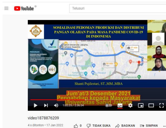
Figure 5. Publication of video socialization of BPOM guidelines on the production and distribution of processed food during the Covid-19 pandemic in millennial culinary businesses on Youtube

Both education was carried out in the socialization of POM Agency guidelines on the production and distribution of processed food during the Covid-19 pandemic in millennial culinary businesses. The whole socialization event can be viewed on the YouTube link https://www.youtube.com/watch?v=dLxbqkI3VsQ (Figure 5).