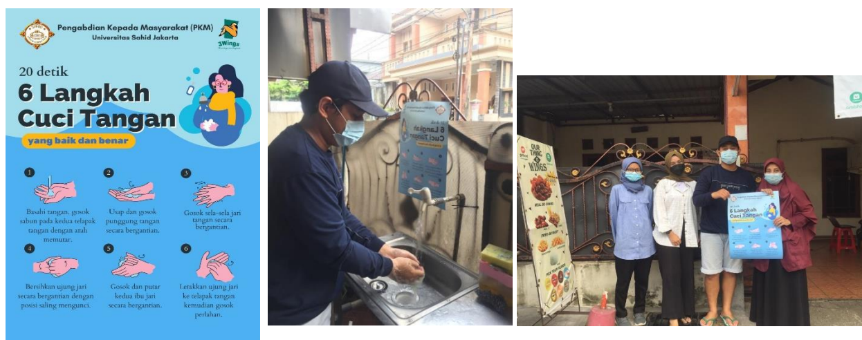
Figure 6. Submission and installation of correct handwashing posters

Socialization participants understood the question of proper handwashing because as many as 80% of participants answered correctly. After socialization of the correct handwashing, there was an increase in knowledge, namely participants by 86.6%. The government has widely done proper hand washing, but the importance of good hand washing in food and beverage MSMEs such as partners needs to be increased again. Increasing understanding of handwashing is expected to improve handwashing behavior in partners. From some studies, it is known that increased knowledge will enhance behavior (Bela et al., (2018), Pujilestari et al. (2019), Septiany et al., (2021), and Calvert et al. (2021)).