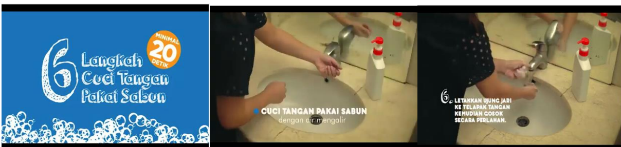
Figure 4. Socialization of the right way to wash your hand

The second education is about socializing how to wash your hands properly. In the guidelines for production and distribution during the Covid-19 pandemic in Indonesia, hand washing is carried out with six steps and 20 seconds. During the pandemic era, as much as possible is done as often as possible, especially out of the toilet. Socialization of handwashing six steps 20 seconds using a video issued from the Ministry of Health (Figure 4). To further improve understanding, further explanation is carried out by the source at each step of hand washing. Hand washing should be done with soap and running water. The six steps are first to wet the hands, rub soap on the palm, then rub and rub both palms in a twisting direction. The second step is to scratch and rub both backs of the hands alternately. The third step rubs between the fingers until clean. The fourth step is to clean the fingertips alternately with a locking position. The fifth step rubs and rotates the thumb in turn. The sixth step is to place the fingertips into the palm then rub it slowly. Socialization of the correct way to wash hands can be seen in Figure 4.