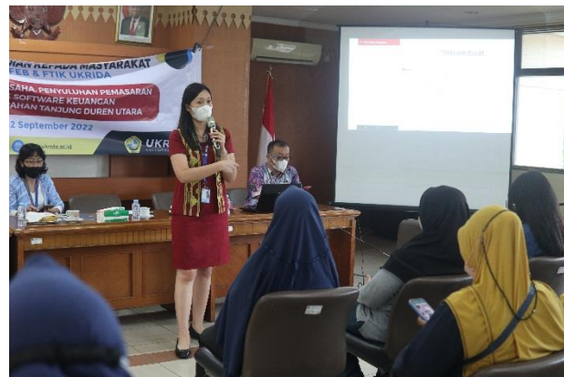
Figure 9. Counseling on accounting software materials