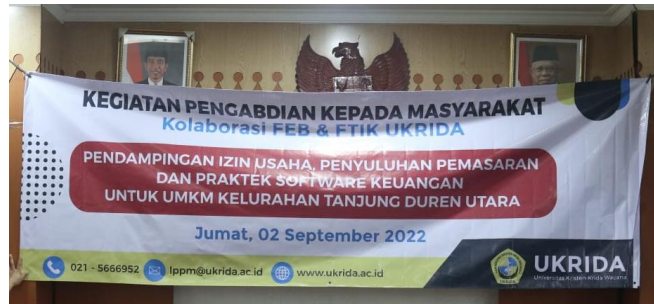
Figure 4. Banner for the implementation of community service activities

The activity has been carried out in September 2022, located in North Tanjung Duren Urban Village. The UKRIDA Community Service Team prepared banners to be used in the implementation of activities and prepared training materials. The municipality prepares a meeting room.