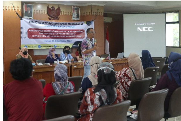
Figure 8. Marketing materials counseling