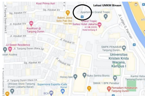
Figure 6. Map of Locations of Subjects who are Partners of the UKRIDA Community Service Team