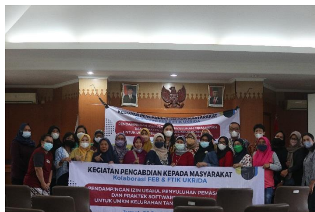
Figure 10. Photo with participants