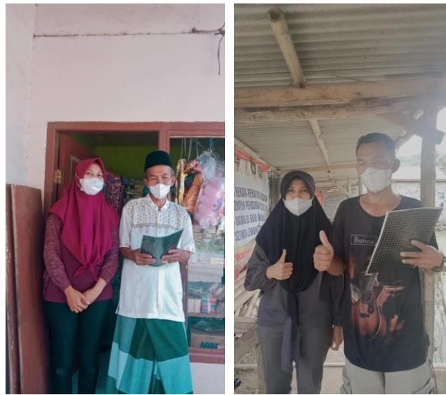
Figure 4. Documentation of mentoring and evaluation activities