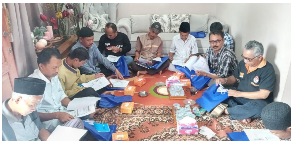
Figure 2. Documentation of workshop activities