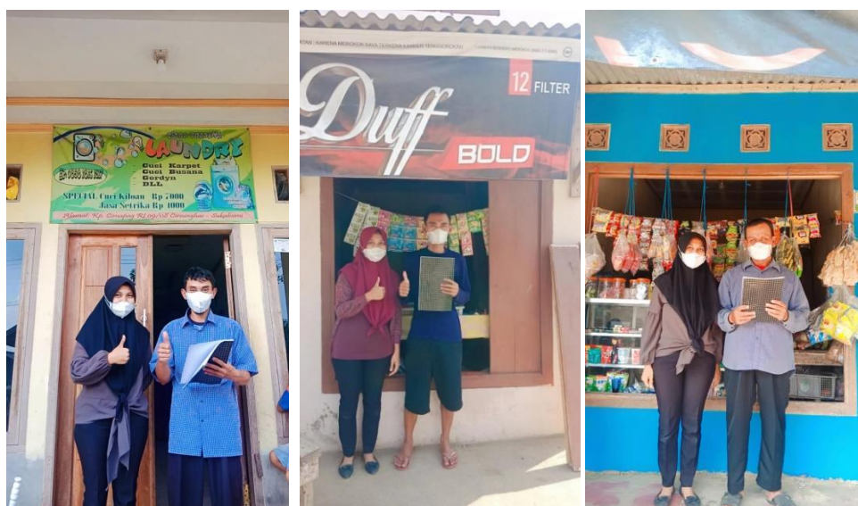
Figure 3. Documentation of mentoring and evaluation activities

Mentoring and evaluation activity went smoothly. This is achieved thanks to the support of partners who want this mentoring and evaluation activity to continue in the future for the progress of their business. The following is a documentation of mentoring and evaluation activities: