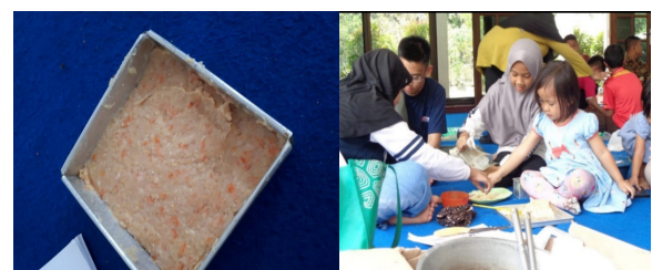
Figure 4. Nugget processing

Before training food processing nugget and sausage, the team explains about Good Manufacturing Practices (GMP). GMP is one of the critical factors to meet the quality standards or requirements set for GMP food; it is beneficial for the survival of the food industry, both small, medium, and large-scale. Through this GMP, the food industry can produce quality food, feasible consumption, and health safety. Good Manufacturing Practices (GMP) explains the requirements for handling foodstuffs in all food production chains, from raw materials to final products.