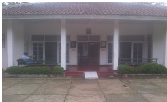
Figure 1. Front view of Tunas Baja Orphanage

Most orphanages in Indonesia lack motivation, the absence of support for the children to conduct further studies, and also the absence of entrepreneur skills for life after graduating from the orphanage. Therefore, providing skills to foster children is needed. Children who turn 18 years old have to leave the orphanages and need to have financial solitude.