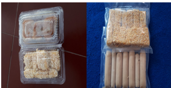
Figure 5. Sausages and nuggets in various packages

All of the participants of this training look enthusiastic about following every step of nugget processing training. They listen to the explanation from the trainers and do their own every stage of processing. They will ask the trainer if they find something they did not understand.