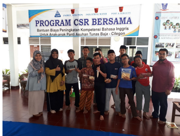
Figure 6. Presenters and trainees

The evaluation results obtained are following the indicator. The evaluation data obtained include: (1) the number of participants who attended as many as 15 people so that the attendance rate reached 100%, (2) the trainees seemed very enthusiastic during the activity until the training are complete, (3) Each participant are pretty active in the discussions at the time of making sausages and nuggets. (4) the expected outcome is that the participants have the skill to produce sausages and nuggets products. The PKM activity has been well. The participants and caregivers of orphanages hope that this activity continues to be sustainable in the future with a variety and innovative products