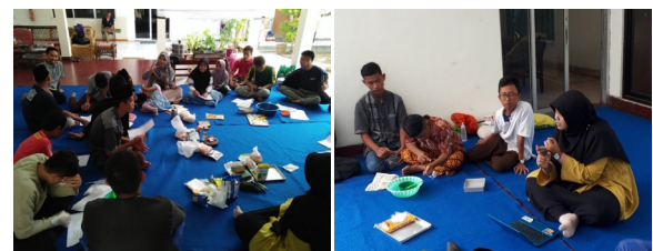
Figure 2. Provision of Materials on How to Process Good Manufacturing Practices (GMP)

Nuggets and sausages are fast food products that are in high demand and well known by the public. Nuggets or sausages are food products that are practical and fast in the process of processing. Nugget products on the market are usually chicken nuggets, beef nuggets, and fish nuggets. Currently, chicken nuggets are one of the top-rated poultry products (Fatimah 2006). Meanwhile, meat sausages define as foods obtained from a mixture of fine meats containing no less than 75% meat with flour or starch with or without seasonings or other food additives permitted and incorporated into the sausage sheath (SNI 01-3820-1995). In addition, sausages define as food made from ground meat and seasoned and wrapped in a casing so that it is symmetrical cylinder-shape