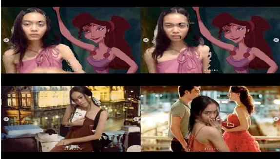
Figure 1. Examples of images in promotional meme content Vol. 2 (2)

detailed representation of the content, which contains a variety of mixed messages such as a product display, a narrative of a story context or inspiration related to the product, and the appearance of objects based on reality (Holland, 2020, p. 5). This content is uploaded in the form of a carousel post (consisting of several images), and is another example of Figure 1 as a display of meme content for the promotion of DEAR Volume 2 products.