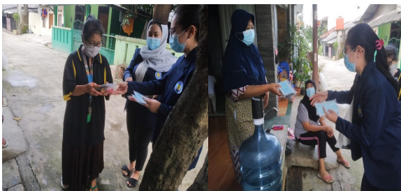
Figure 4. The team explaining how to use a mask properly

In addition, the community service team also distributed masks to the community with the aim of educating the public to continue to comply with health protocols to be able to take care of each other and prevent the spread of Covid-19, as shown in Figure 4. The community service team also educate how to wear masks properly. The benefit achieved from this activity is that the public becomes aware of the importance of health protocols in this pandemic era.