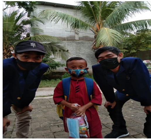
Figure 5. Distribution of gifts to children as a form of appreciation

Another supporting program carried out in this program is to focus on education about covid-19 to children, and as a form of invitation and a form of appreciation to children who want to learn and care about the dangers of covid-19, a gift is given for the children, as shown in Figure 5.