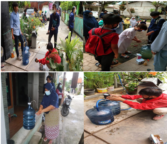
Figure 3. Hand washing socialization with automatic hand wash

In this activity, the community service team carried out activities by making hand washing facilities equipped with hand sensors, aimed at preventing physical touch that could cause the transmission of the Covid-19 virus. In addition, this automatic hand washing place aims to provide facilities around the community so that they can maintain cleanliness anywhere and anytime very easily. The target of this activity is all residents of Pondok Aren, as shown in Figure 3.