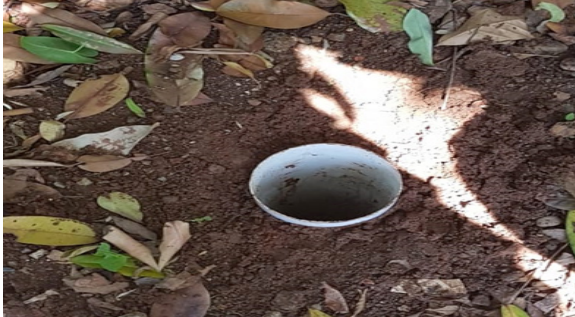
Figure 4 Post-Rain Biopore Infiltration Hole Conditions

At the evaluation stage of the community service team made a WhatsApp group of trainees. Participants will report an evaluation of the biopore holes every two weeks. Based on the evaluation results reported by participants for three months, biopore holes are effective enough to reduce inundation when rain occurs. In addition, compost from biopore holes has matured after three months.