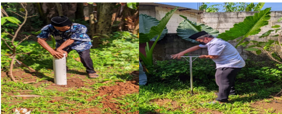
Figure 2. Practical training of making biopore holes