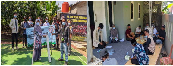
Figure 1. Handover of tools to make biopore infiltration holes, & Counseling on the importance of waste management by type and providing practical, theoretical material for making biopore holes