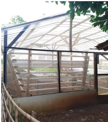
Figure 4. Another Green House Construction