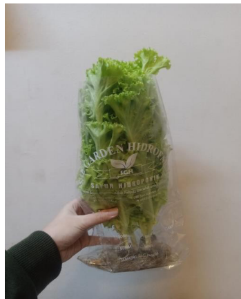
Figure 9. The plant in package to be sold (Selada)