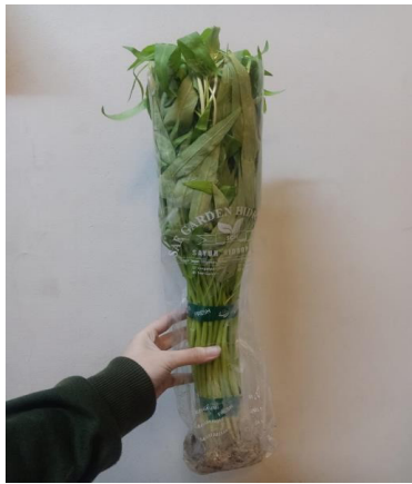
Figure 11. The plant in package to be sold (Kangkung)