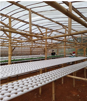
Figure 5. 10.000 holes to be planted