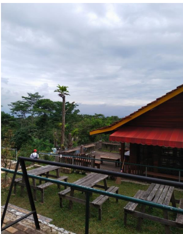
Figure 6. Better view for visito