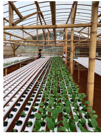
Figure 7. Two weeks vegetable plants