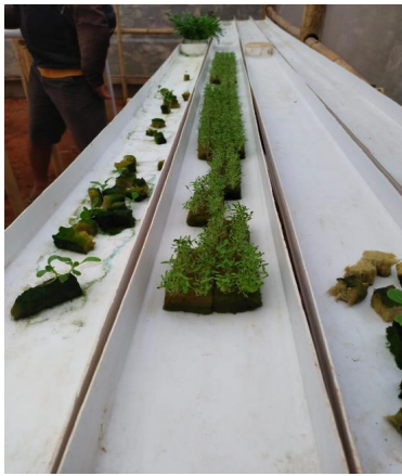
Figure 3. Rockwall