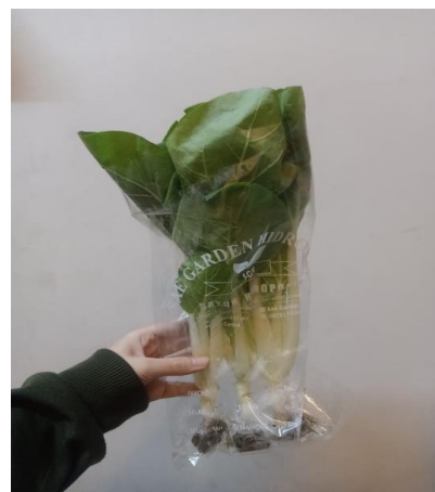
Figure 10. The plant in package to be sold (Pak Choi)