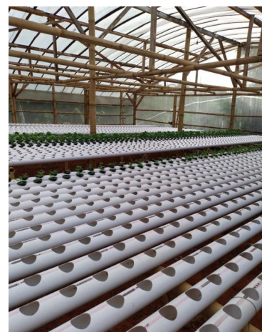
Figure 2. Pipe and holes of Sae Garden Farm