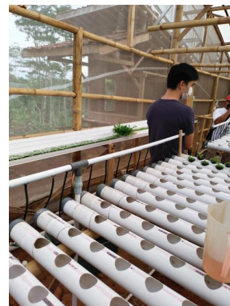
Figure 1. One of Green House in Sae Garden Farm