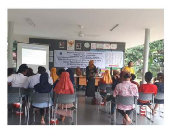
Figure 1 and 2. The State of Training

To strengthen the explanation for the danger and negative impact of social media, particularly YouTube , she presented the danger and negative impact of pornography on YouTube as shown in the following figures :