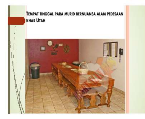
Semua akses internet diblokir kecuali website ensiklopedia online. Akademi ini mempunyai guruguru SMA dan para murid menghabiskan banyak waktu untuk belajar selama terapi

Moreover, she also presented alternative solution on the handling of pornography addicts having been carried out in USA, i.e. the special school for pornography addicts in Oxbow Academy, Utah, USA. The school is the pioneer school to cut the pornographic addiction for adolescents in USA. Parents of the students in USA who consider that their children are in pornography addiction can enter their children into the school.