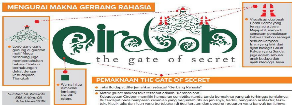
Figure 1. Tagline The Gate Of Secret (Radar Cirebon.com 9 Maret 2019)