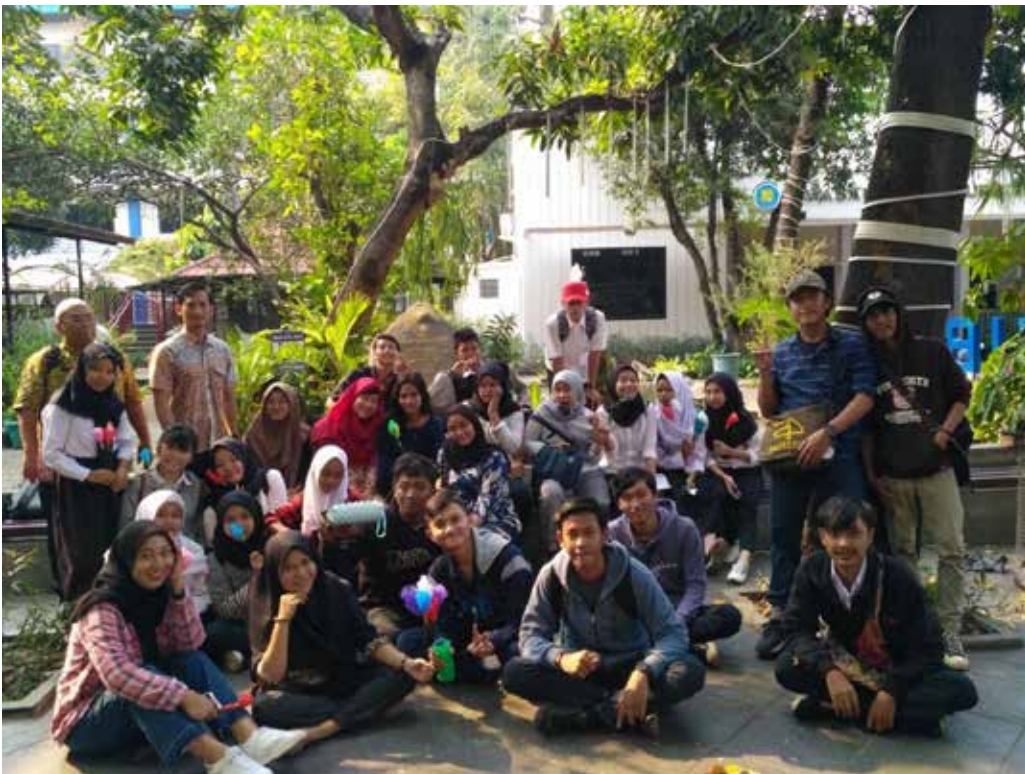
Picture 5 : Taking Picture Together with the Re-Used Plastic Waste Products

c. In the final stage is do reporting the activity results.