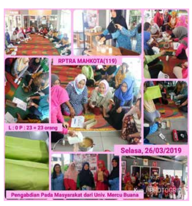
Figure 5. The implementation of organic homemade soap making workshop