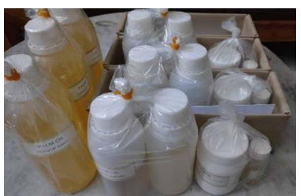
Figure 1. Basic ingredients for making soap