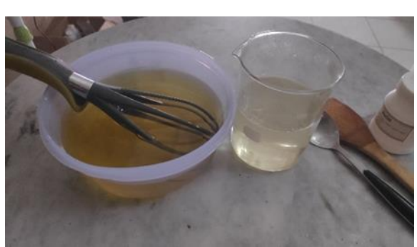
Figure 4. Mix NaOH solution with oil