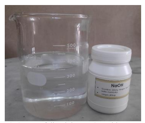
Figure 2. Stages of dissolving NaOH with water