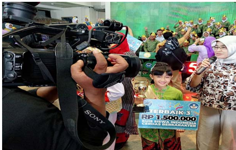
Picture 1.5 Winner Announcement