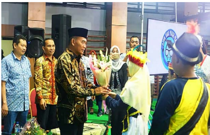
Picture 1.6 Participants with Javanese Culture