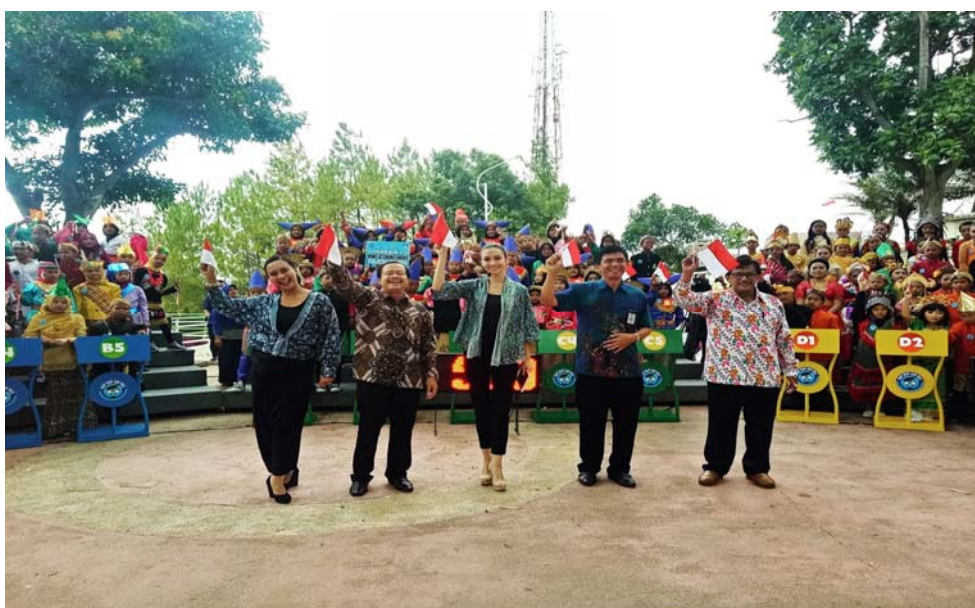
Picture 1.2 Training Session