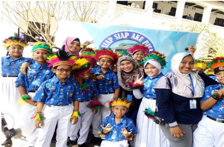
Picture 1.4 Winner announcement