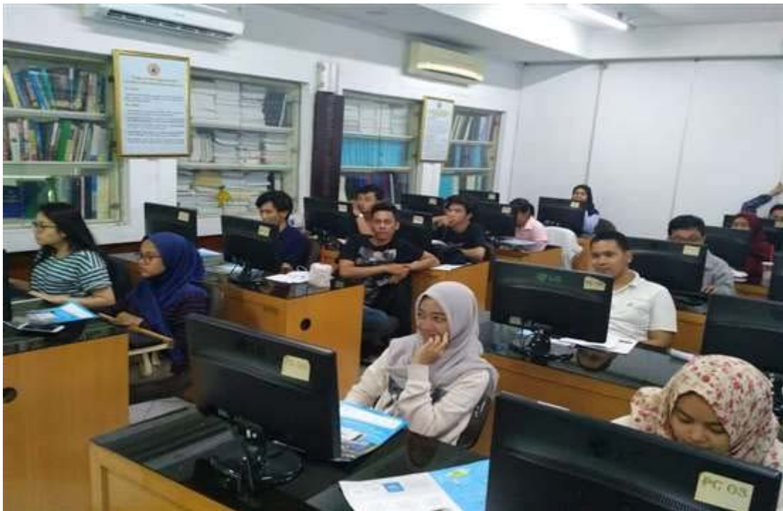
Picture 3. Learning Session