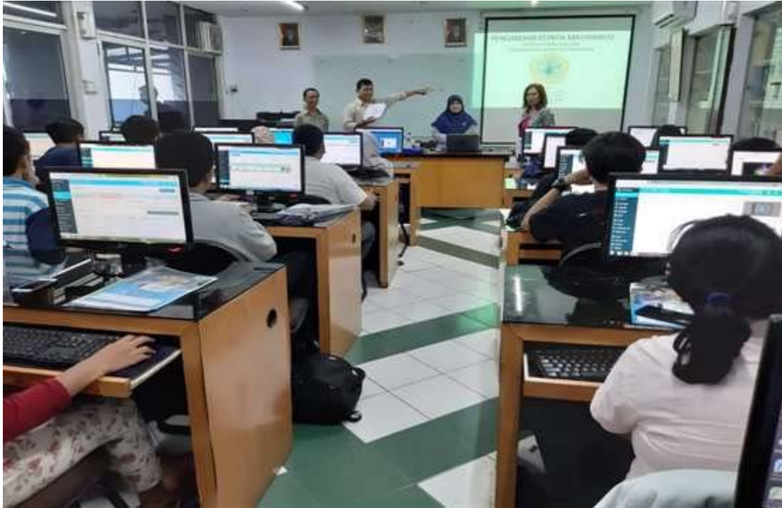
Picture 2. Opening Session