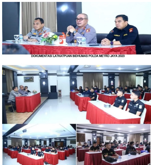
Figure 12. Public Communication Improvement Training in the Field of Public Relations Writing in Digital Media for Public Relations Personnel of Polda Metro Jaya