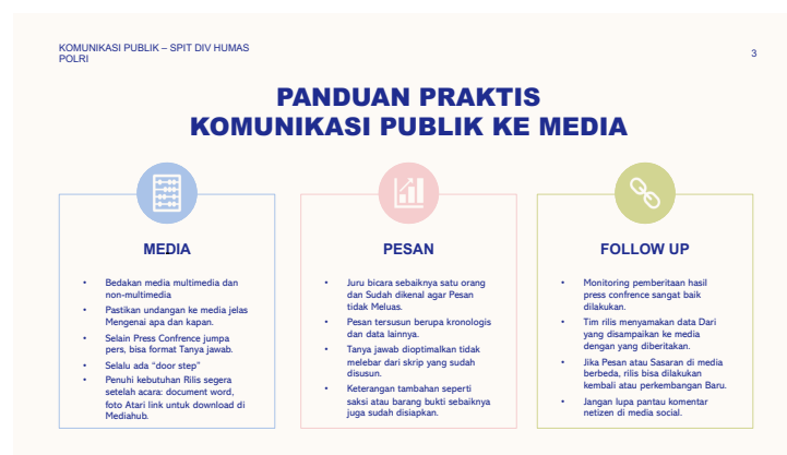
Figure 9. Public communication and media guide