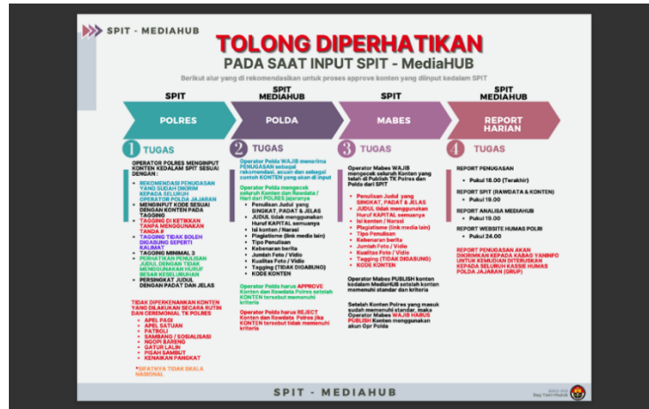
Figure 10. content process recommendation flow