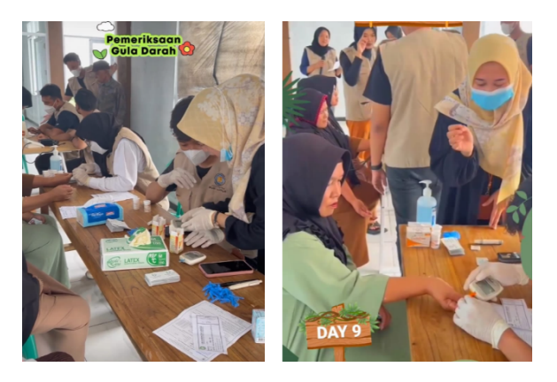
Figure 8. Blood test

Data of residents who under health checks are stored digitally. Conventional data storage media are converted into digital storage. This digital-based data recording system is expected to make it easier for medical officer to search when residents seek treatment at the health center. The data of residents that are stored include those in Table 3 below