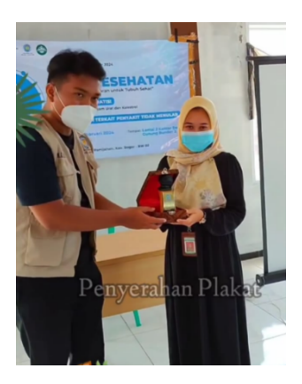
Figure 3. Giving souvenir

The medical assistant is a very important and very needed to increasing public awareness, through counselling and socialization in health checks. A companying lecturers also responsible and called to help increase public awareness in maintaining health (Situmeang, 2020). This activity is a community service by lecturer as a manifestation of the Tridharma. Students also active in this activity, students learn to apply their knowledge in society. The role of students in the activity by representing in giving souvenirs from the university to the Cibening Health Center, seen in Figure 3. below;