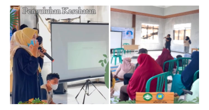
Figure 6. Counselling

Preparation of the activity since 06.00 where the committee has started gather to prepare for the implementation. After that, the committee representative picked up the health team at the Health Center to start a briefing to align the perception of the activity between the health center committee and local respondents. Furthermore, the core activity began at 09.00 with counseling and interactive discussions about the importance of maintaining cleanliness for health. Many residents asked about the relationship between cleanliness and health, how to deal with waste so that it does not pile up and how to maintain health caused by the accumulation of waste. All questions were answered clearly and discussed with health counselors and local officials so that the problem could be resolved together. Residents need correct information about health and certainty regarding waste disposal. The inspection activity is as seen in Figure 6.