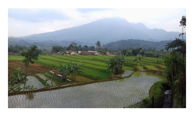
Figure 1. Gunung Bunder 2 Village

Gunung Bunder is the one of the villages in Pamijahan District, Bogor, West Java. The climate of Gunung Bunder Village like other in the tropics, has a dry and rainy climate (Yuviani, 2022), this has a direct influence on the soil patterns in Gunung Bunder Village. The climate of an area greatly influences life, a view of Gunung Bunder Village 2 as in Figure 1 below;