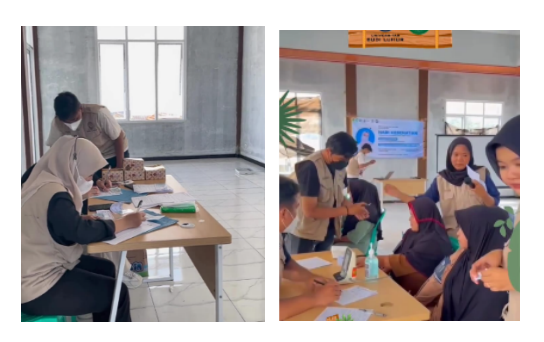
Figure 7. Data recording

After the counselling was completed, it was continued with a health check. Before the blood test was carried out, residents were asked for personal data, health history and daily lifestyle. Resident data collection was assisted by students, as seen in Figure 7. The following