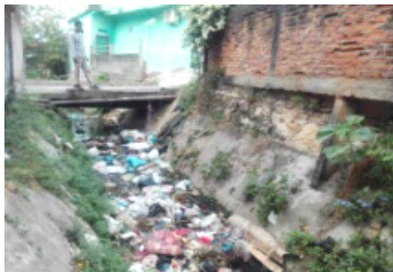
Figure 2. Piles of waste

The results of the literature study followed by observation and analysis, the problems found include, low public understanding of healthy lifestyles and the importance of regular health checks and early detection of diseases (Wulandarai, 2022). Based on this, the problems in Gunung Bunder Village that will be raised as community service are counseling on the importance of maintaining health accompanied by health checks that include hypertension, blood sugar, cholesterol, uric acid and other basic health checks.efforts to improve health in the residents of Gunung Bunder 2 Village. They start from the habit of piling up garbage or throwing it into the river where the water in the river is used for daily needs. Handling garbage is still hampered by many parties. In an effort to reduce the impact of garbage accumulation (Syifa Fauziah, 2023), the proposing team helps maintain health through community service activities by providing free counseling and treatment (Trisnayanti, 2021).