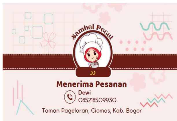
Figure 3. Canva Design Business Card Maker

The following are the design results using Canva made by participants: