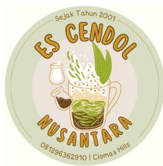
Figure 4. Design a Business Logo with Canva

In the process of creating a business card, users can choose from a variety of templates that Canva has provided, customize it to their business identity, and enter important information such as business name, logo, contact, and slogan. The resulting business card not only looks professional, but can also reflect the characteristics of the business visually. The use of appropriate colors, fonts, and layouts can help MSMEs strengthen their image in the eyes of potential customers or business partners.