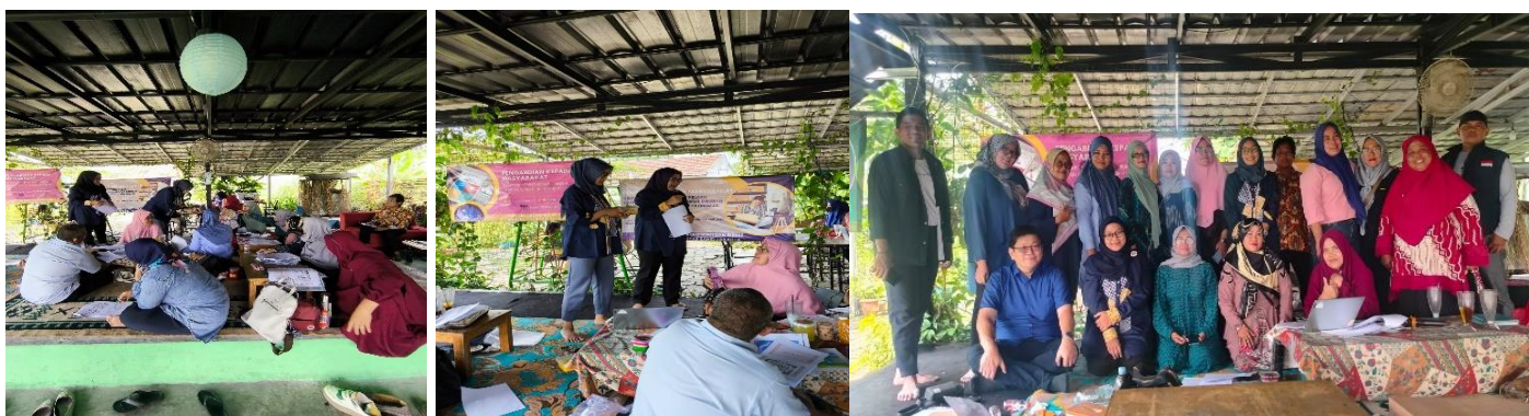
Figure 5. Implementation of Training Activities