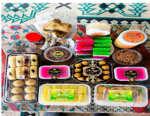
Figure 6. MSME's Business Products

Figure 6 is food and beverage products from MSME actors in Ciomas. Food MSMEs in Ciomas have great potential to grow, considering that this area is rich in culinary diversity and local culture. Various typical food products are produced by local MSMEs, ranging from traditional foods to interesting culinary innovations. Some of the superior products that are often encountered include wet cakes, traditional snacks, to modern processed foods such as frozen food and desserts. The potential for the development of the culinary business is even greater if it is supported by an attractive design, because aesthetic and professional visuals not only increase the attractiveness of the product, but also strengthen branding and make it easier for consumers to remember the product. Creative and consistent design on packaging, logos, and digital promotional materials can make culinary products stand out more in the market, while giving the impression of higher quality, so that it can attract more customers and expand market reach.