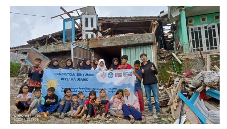
Figure 19. Part of the students in front of wreakag

Figure 18 Part of students outside the tents