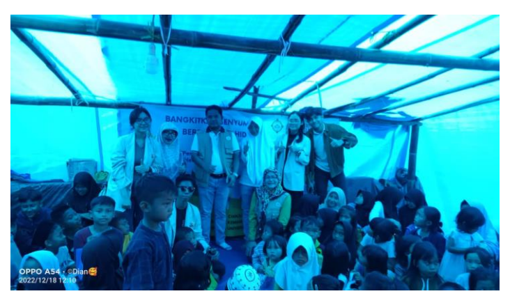
Figure 6: All team together with all children

After we got to know each other, we delivered the learning session. They were devided into four age group as follows: 1. Group of Playgoup and Kindergarten level