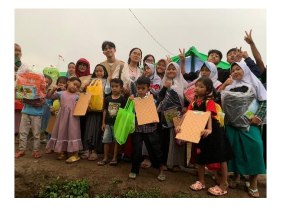
Figure 18 Part of students outside the tents

All children received packages which consists of a schoolbag, books, stationaries, other school equipment