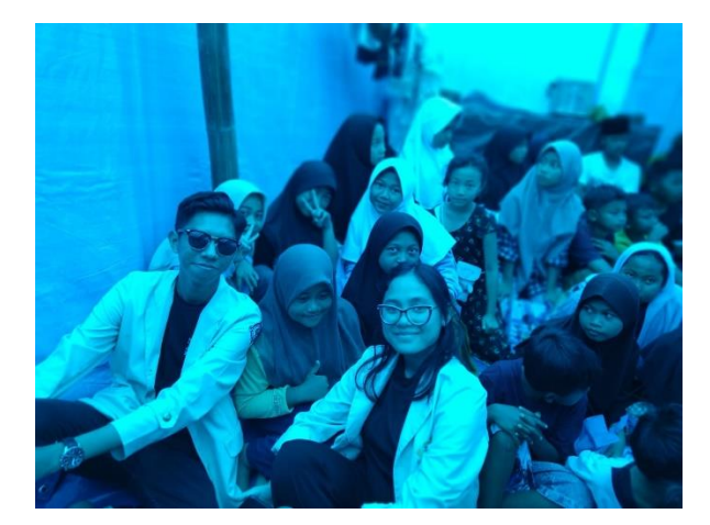
Figure 16 Before saying good bye : class of junior high school