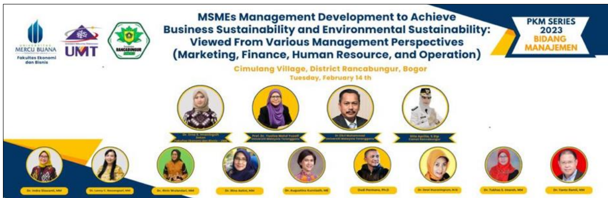
Figure 2. Banner of the Speakers

The community services are being carried out online via Zoom Meeting. The Community Services activities with the topic of Implementing Strategic Sustainability Business on the Micro, Small and Medium Enterprises with the collaboration of Universiti Malaysia Terengganu, Malaysia.