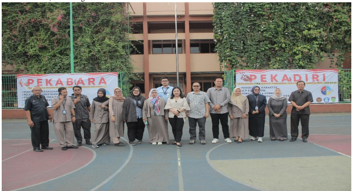
Figure 2. The Speaker, Presenter, and Teacher (as School Facilitator)

In the evaluation section, participants are required to fill out a pre-activity questionnaire involving three interrelated parts: understanding national insight, character building, and character strengthening . This questionnaire refers to several theories that refer to the understanding of state defense, as explained by Rahayu (2019) in the journal "State Defense Awareness in Students." The questionnaire is used as a tool to measure the understanding and level of awareness of defending the participant's country before participating in educational activities. In addition, a post-activity questionnaire was also applied, which included questions about whether there was a change in the understanding and level of awareness of defending the participants' countries after participating in the activity. The results of these two questionnaires will be used to evaluate the effectiveness of national insight education and state defense using Denzin and Lincoln (2009) qualitative research method. National insight and state defense education at YUPPENTEK High School in Tangerang City aims to equip students with knowledge and understanding of national defense and encourage them to play an active role in advancing the nation and state. Through relevant approaches, methods, and materials, it is hoped that participants can become young people who have basic national defense skills, love for the motherland, and strong national and state awareness.