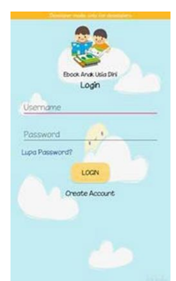
Figure 7. Login Page

Login page serves to give user permission to carry out activities in the application On the login page the user will input a username and password. The system will validate the