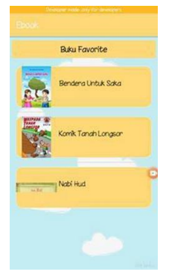
Figure 9 Favorite Book page

This page displays all book data that has been liked before. And can be viewed again by the user.