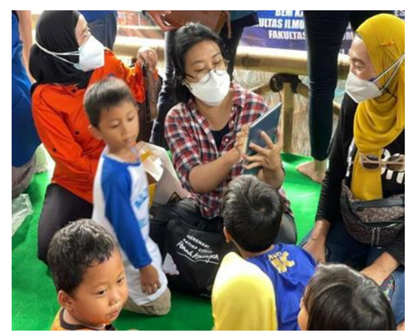
Figure 4. Activity Implementation

The availability of devices and how to use devices that support the implementation of digital literacy. Increasing the ability of RUMI managers to master the use of digital devices and digital applications as a means of literacy. The availability of digital book application modules that support the application of digital literacy. The increasing ability of RUMI managers to master digital book applications as a medium to support digital literacy.