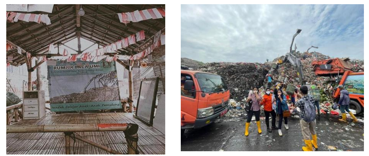
Figure 1. Preparation Stages

Based on our observations, children in Bantar Gebang tend to lack interest in reading. Moreover, they are often asked to help their parents instead of going to school. Especially during the COVID-19 pandemic, where teaching and learning activities are carried out online. This is supported by several statements from parents who mostly work as scavengers.