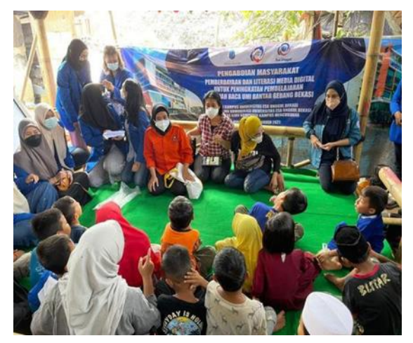
Figure 3. Activity Implementation Briefing

Community service activities were carried out by lecturers from the Faculty of Computer Science, Universitas Mercu Buana and the Faculty of Communication Sciences, Esa Unggul University, which were held on Saturday, March 3 - October 4, 2022, directly. The partner of this activity is landfill site Bantar Gebang, especially the Sumur Batu village, Bekasi Regency to improve digital literacy skills and empower RUMI. For this reason, this program is carried out as an effort to educate and digital literacy for children of scavengers in the Bantar Gebang landfill site area.