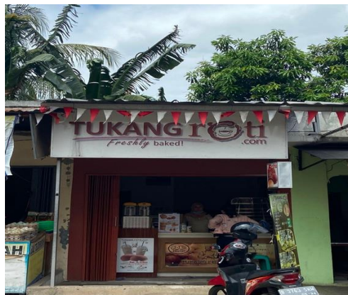
Figure 1. SMEs Tukangroti.Com Pangkalan Jati Depok