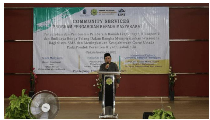
Picture 2. Welcome by the Head of Cimanuk Village - Pandeglang, Banten

Picture 1. Welcome and Opening of PkM Activities by the Head of PonPes Riyadhussholihiin