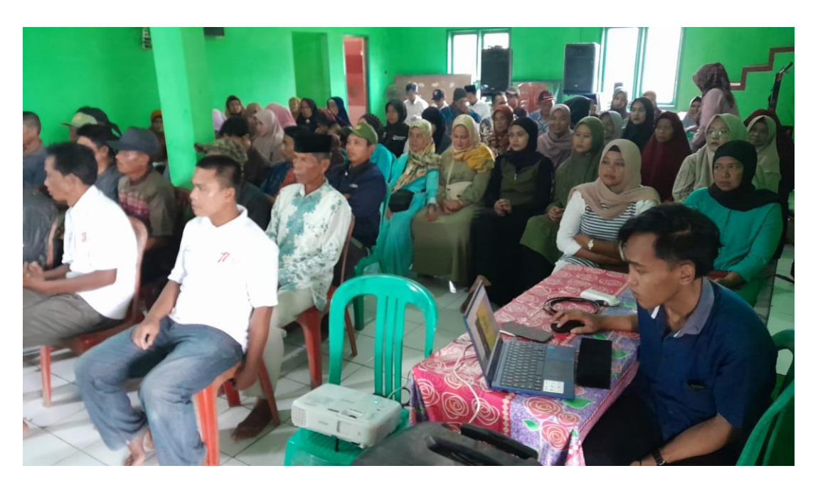
Figure 3. Socialization Implementation