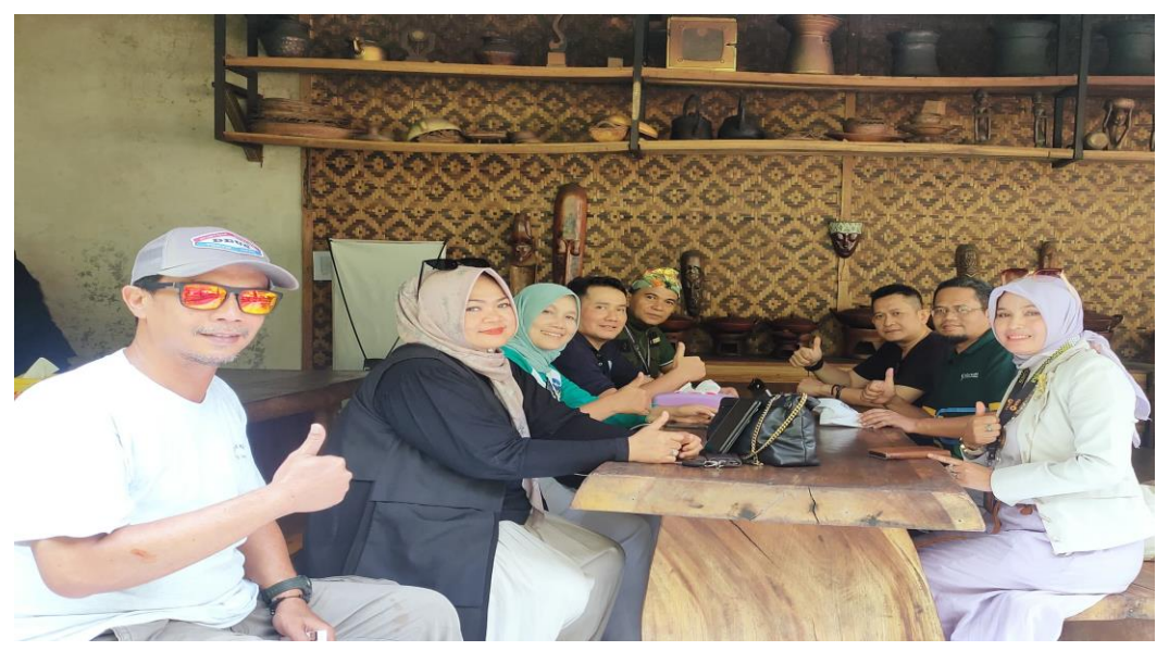
Figure 2. Visit with MSME Partners

To find out the problems faced by partners, we held a direct visit with the head of the RW in Penjaringan District, North Jakarta, and the head of the MSME group in Penjaringan District, North Jakarta. From this activity, information was obtained on MSME actors who need assistance because the packaging is not yet attractive. MSMEs selected for assistance are also determined based on the lowest turnover obtained. The following picture shows the process of indept interviews and direct visits with partners.