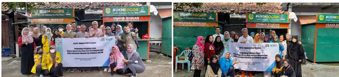
Figure 5. Joint Photo of Cooperative Management and MSME Actors as Cooperative Members