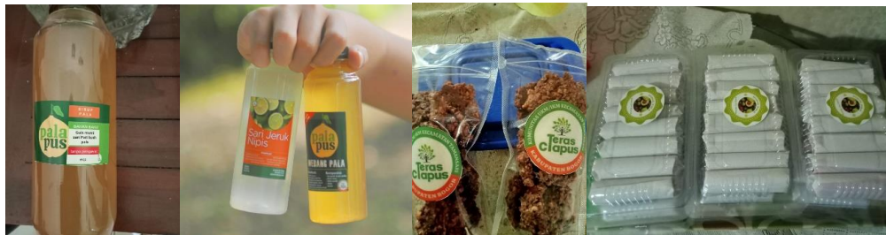
Figure 2. Beverage and Food Products Processed by the Community