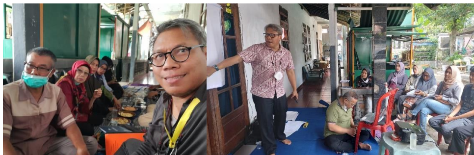
Figure 4. Guidance for Cooperative Management and UMKM Actors