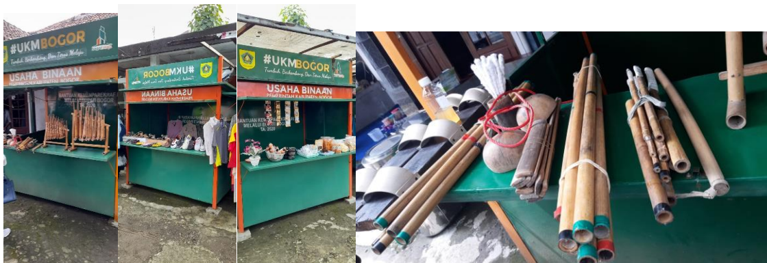
Figure 3. Hasil kerajinan dan mainan masyarakat Desa Wisata Pasir Eurih