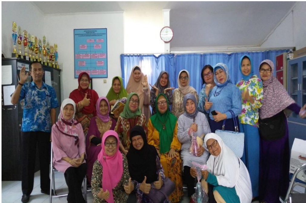
Figure 1. Photo of Partners of PKK RW 06 Ministry of Finance Complex, Karang Tengah – Ciledug

With the existence of E-commerce, it is hoped that it will bring benefits for PKK mothers to sell online. Optimization training by utilizing existing social media and e-commerce as marketing media to support business opportunities during the Covid 19 pandemic. Currently, there are still many residents who do not dare to carry out their activities outside. So the marketing and sales process is difficult. However, the rapid development of technology causes changes in various sectors of human needs, one of which is in the business sector. The change towards digital makes it easy for people to be able to sell and market their products online with digital marketing