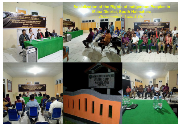
Figure 2. Socialization of The Right of indigene peoples in Maba District

In carrying out this activity, the executor of community service activities collaborated with the Postgraduate Program at Kahirun University, Ternate and Bicoli sub-district, Maba Maba, North Halmahera. The form of the activity was carried out in the form of a discussion led by a moderator of the Faculty of Law, University of Khairun Ternate, this activity was attended by 25 participants who came from traditional community leaders who incidentally have become one of the village officials, traditional leaders and the Bicoli community. In the discussion, there was an explanation by the executor of community service followed by a question and answer dialogue