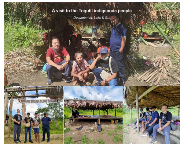
Figure 3. A visit to the togutil indigenous people

accordance with the Basic Agrarian Law, while in the event of a dispute or taking customary land for tourism development purposes, the recognized land regulations are based on the Basic Agrarian Law