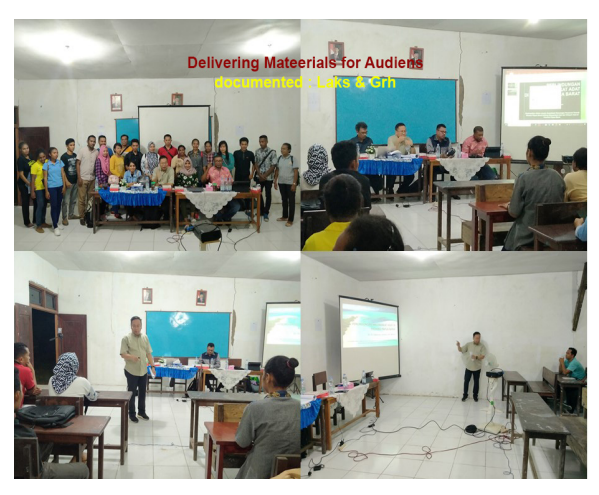
Figure 2.Deivering Materials for Audience

of indigenous peoples in Teluk Bintuni district and the form of its implementation. The socialization was carried out by giving lectures with topics that had been prepared followed by a question-and-answer session, in this session things happened as expected the questions asked by the participants on average showed their lack of knowledge about the regional regulations.