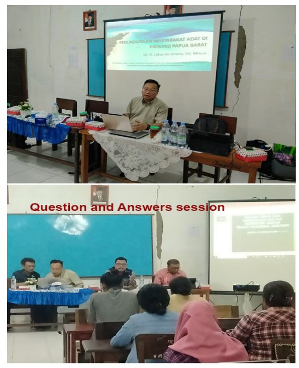
Figure 3. Question and Answers Session

The rights of indigenous peoples themselves include a). customary rights; b). clan rights over land and natural resources and their utilization, c). the right to obtain compensation from the use of natural resources by outsiders, d). the right to obtain the sharing of benefits from natural resources, genetic resources and traditional knowledge by outsiders, e). the right to take care of oneself, f). the right to exercise customary law and justice, g). the right to spirituality and culture, and h). other rights regulated in laws and regulations.