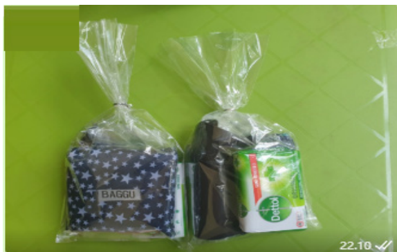
Community Empowerment In Tourism & Creative Economy

In order to encourage eagerness of the participants, all participants were given souvenirs which were sent to the RPTRA which then distributed them to the participants around a week after the webinar. This souvenir was also to address the message of being still aware of the COVID-19 pandemic, as well as care for the environment. It was a goody bag with a mask, soap, and reusable shopping bag. As mentioned before, the purpose of giving out such souvenirs was to pass the message of keeping health protocol and acting environmental friendly. Below is a picture of a sample of a goody bag