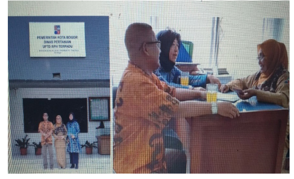
Figure 4. Photo of Coordination and face validity directly to the Head of Regional Technical Implementation Unit (UPTD) RPH Integrated Bogor City

Community service evaluation activities are carried out through coordination and face validity directly to the Head of Regional Technical Implementation Unit (UPTD) R-S Integrated Bogor City (Figure 4).