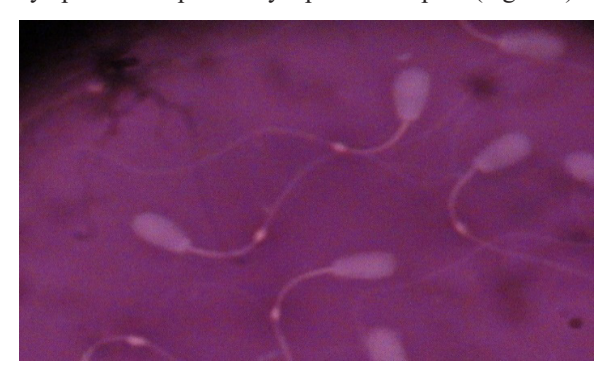
Figure 3. Photo of Secondary Abnormalities, Cytoolasmic Droplets (arrows) of Bovine Spermatozoa of Balinese Cattle Epididymis Origin

Abnormalities of primary spermatozoa (in the head) between 8.88 to 9.86%. Secondary abnormalities are high enough to reach 80% namely the presence of residual cytoplasmic droplets or cyto plasmic droplets (Figure 3).