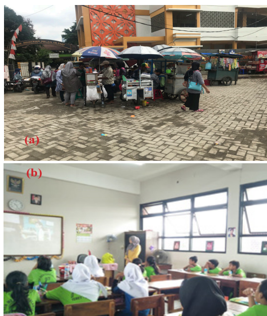
Figure 2. (a) Food Vendors in front of School Gate, & (b) Students watched the education cartoons