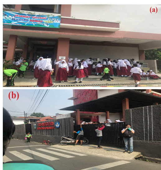
Figure 1. (a) Students Jostle Purchasing Food in School's Canteen, & (b) The Street Food Vendors Are Passing the Food Over the Fence

Unlike SDN Menteng Dalam 07 Pagi, at SDN Menteng Dalam 05 Pagi, students seem to be free to enter and exit the school area because the school has a wide-open fence. In front of the school, there are also stalls selling snacks that are permanently built. Moreover, street food vendors always present during breaks and after school. Meanwhile, the school canteen was not visible at the time of the initial observation. Students buy snacks outside of school during breaks and after school and there seems to be no prohibition from the school. Not only students, but many parents also buy snacks outside the school when they pick up their children as shown in Figure 2a.