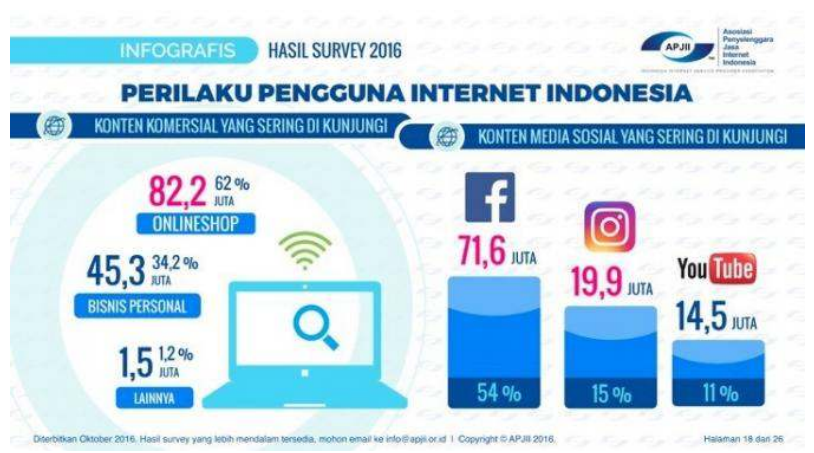
Figure 2. Results of the 2016 APJII survey about the behavior of internet users in Indonesia

because of the convenience offered by online sales systems. Consumers can find out the details of the product they will buy from information on the online store or from the product manufacturer's internet site. Consumers can also compare prices from different shops, so they can get the best price from the product they want to buy. Another thing that is taken into consideration is that consumers do not need to move from their place to get the product they want, even now there are many online stores that provide delivery services that can deliver ordered products on the same day. Of course this is very helpful especially for buyers who are in a big city like Jakarta which is almost never empty of traffic.