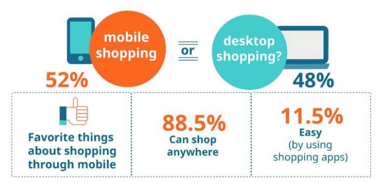
Figure 3. Prediction comparison of online sales transactions from cell phones compared to computer devices

Shoe and bag craftsmen in Pasirmulya can use social media to market their products online. It is hoped that the use of online-based marketing techniques can increase the reach and effectiveness of the sale of their products. Of course the biggest hope is the increase in sales turnover which will increase the socio-economic level of the craftsmen in Pasirmulya village, so that it can reduce the poverty rate which is still quite high. Even though the people in Pasirmulya village are very familiar with mobile devices and the use of social media, they do not yet have the required knowledge to start these activities. The ability to operate computers is a basic skill that needs to be mastered by the Pasirmulya village community. For this reason, a training is needed that can equip them with knowledge that can later support the marketing of handicraft products.