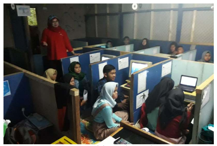
Figure 7. Training Implementation

The trainees will use one computer unit available at the Village Hall for each group consisting of 3 people. The grouping of participants needs to be done considering the limitations of the number of computers available at the Village Hall. Regarding this, each training session will be limited according to the number of computers available. Currently there are 5 computers available at the Village Hall which can be used to support this training activity, thus the number of participants that can be accommodated in each training session is 15 people. The number of training sessions that will be implemented is adjusted to the number of participants who are interested in participating in the training. As shown in Table 3, the training will be carried out in 3 sessions per day with a duration of 1.5 hours per session. The first session was held at 9.30 - 12.00, the second session at 12:00 - 13:30, and the third session at 14.00 - 15.30. Each instructor will deliver the material for one full day.