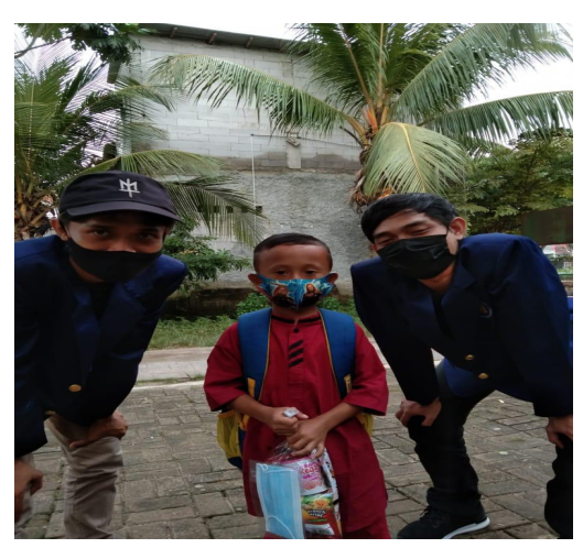
Figure 5. Distribution of gifts to children as a form of appreciation

Another supporting program carried out in this program is to focus on education about covid-19 to children, and as a form of invitation and a form of appreciation to children who want to learn and care about the dangers of covid-19, a gift is given for the children, as shown in Figure 5.