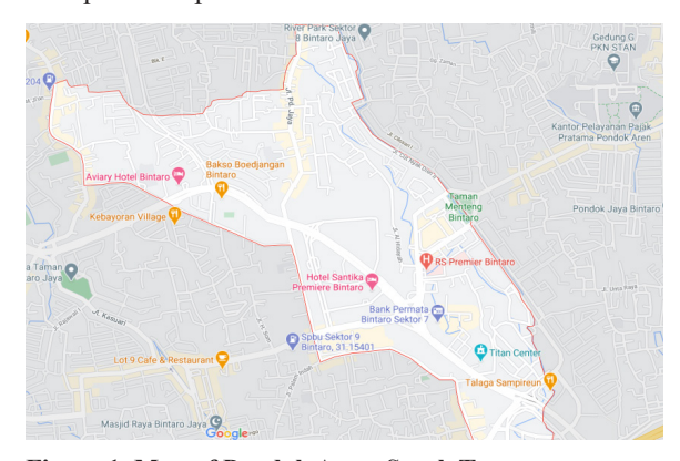
Figure 1. Map of Pondok Aren, South Tangerang

The implementation of the community service program was carried out in Pondok Aren District, South Tangerang, more precisely around the housing estate on Jl. Reform RT 05 RW 01, Pondok Jaya Village, Pondok Aren District, South Tangerang, in the area of Aisyah Syamsi Mosque Jl. Iwapi lot.