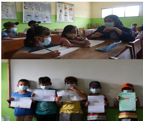
Picture 2. Educational Program for Children