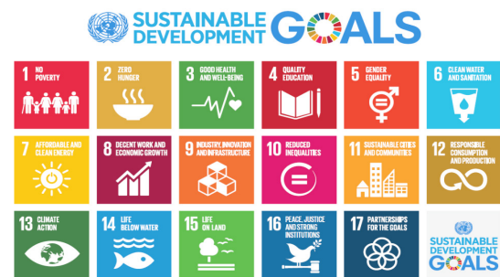
Figure 1. Susatainale Development Goals (SDG)

Through education, a path towards good health, empowerment, employment and improve the standard of living can be achieved. Besides that, education can also aid in building happier societies. There are numerous contributions in the field of quality of life which highlights the link between education, employment and welfare (Greenhaus, Collins and Shaw, 2003; Morett, 2004; Ferrante, 2009).