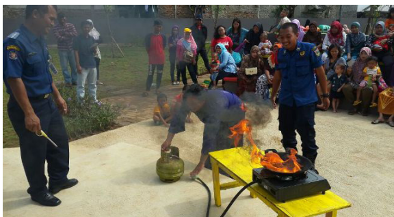
Figure 3. Socialization for Residents at RPTRA from the DKI Jakarta Fire Department