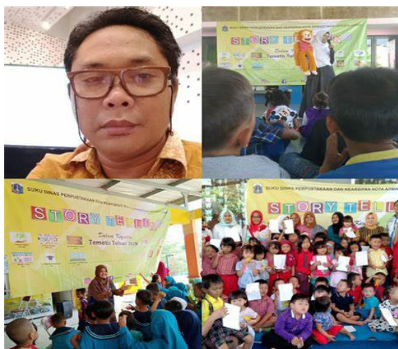
Figure 2. RPTRA as a Means of Socialization and Learning implemented by North Jakarta Sub-dept. Pursip

The power to achieve legitimacy and community experience and understand the direction the community wants through dialogue in the public sphere, while the community can voice their interests so that the government can accommodate them. Only through this public sphere can a mature society be realized and free from oppression and overcome the crisis they face.