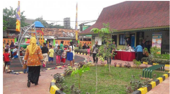
Figure 1. One of the RPTRA in Jakarta

called "Come to the Park" to introduce Child Friendly Open Public spheres (RPTRA). This program is referred to as a form of introduction and at the same time an invitation to the community to use city parks as public spheres. This program emerged against the background of the lack of public interest in using city parks as public spheres and it is alleged that most DKI Jakarta Provincial Government residents tend to prefer to spend their free time in shopping centers or other hangout spots rather than in city parks so that the existence and function of city parks neglected public sphere.