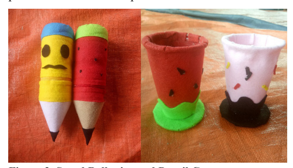
Figure 2. Stand Ballpoint and Pencil Case

In the early stages, the facilitator will briefly explain the purpose of the activity and its benefits. The facilitator will explain one by one the tools and materials that will be used so that trainees can recognize them directly. Furthermore, there will be a demo of how to process plastic waste by illustrating examples of results that have been created as visualization materials for children when practising them. The program that aims to develop the creative economy of its people is expected to succeed in creating a creative industry for the students of Yayasan Langkah Kecil Indonesia. The results achieved in this program are the procurement of supporting equipment activities, training on the utilization of plastic waste or used goods, and training in processing plastic bottles into a pencil case and stand ballpoint.