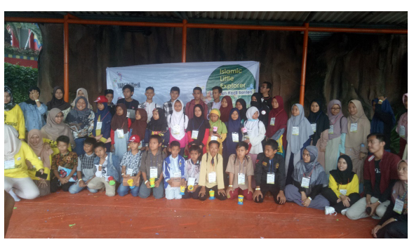
Figure 3. Photo with Participants from Yayasan Langkah Kecil Indonesia