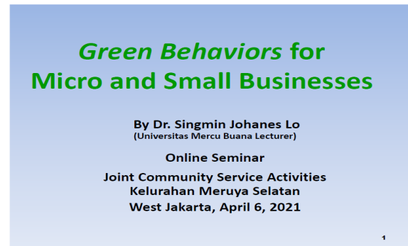
Figure 1. Slide Presentation (1)

presented the material using power-point software interactively, followed by inter-active discussions.