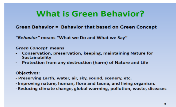
Figure 2. Slide Presentation