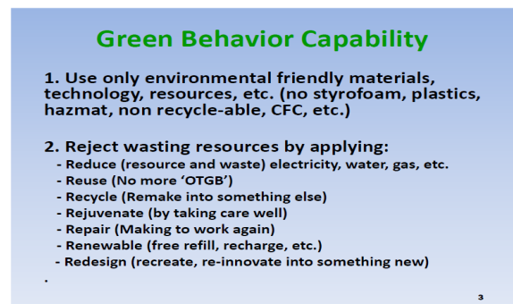
Figure 3. Slide Presentation