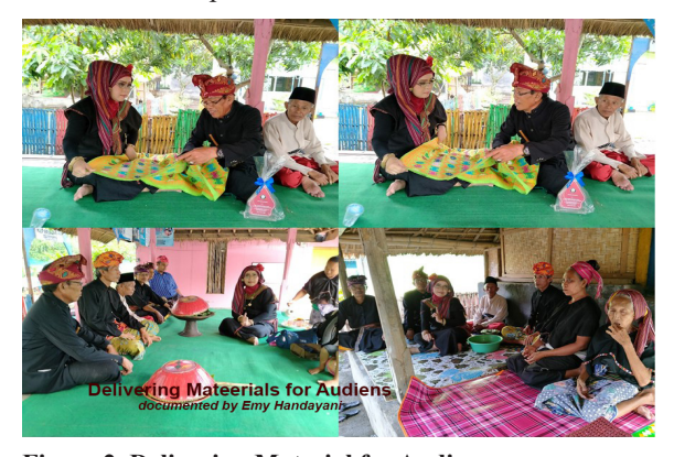
Figure 2. Delivering Material for Audiens

Meanwhile, it is further strengthened by the Copyright Law number 28 of 2014 in article 40 paragraph 1 that "Protected creations include works in the fields of science, art, and literature" which in letter j is "works of batik art or other pattern art"