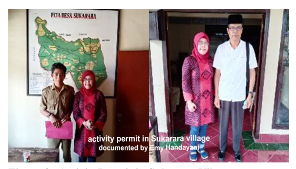
Figure 3. ActivityPermit in Sukarara Vilage