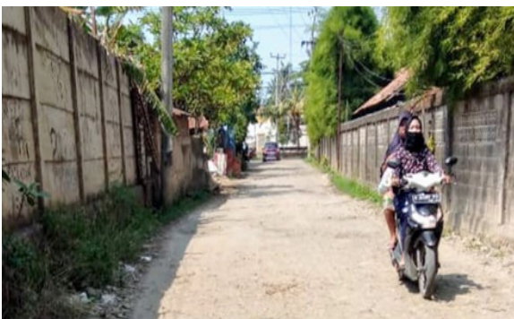
Figure 2. Condition of the tsunami evacuation route in Cikoneng Village, Anyer, Serang Regency

Although it has been damaged for years, the local government has not yet repaired it.