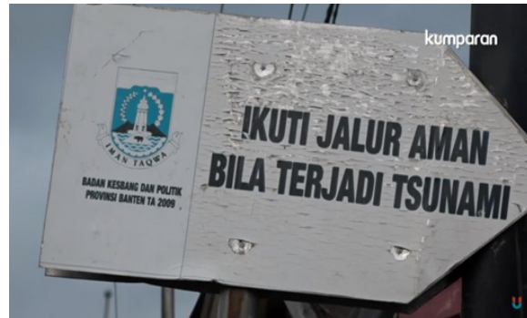
Figure 3. Signs of the Disaster Evacuation Path in Cikoneng Anyer Village, Serang Regency

A sign system is a collection of individual signs that have been designed to identify or direct. The signs used in a sign system basically express the meaning of the rules which are international standards, so that it will be easy for everyone to understand (Phill Boines, 2008; 17).